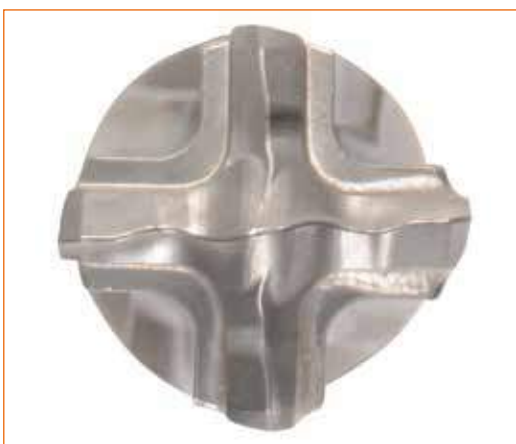
Hartmetallplatte bis Ø 28 mm, einteilig / Carbide plate up to Ø 28 mm in one piece