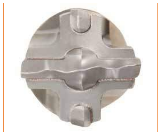
Hartmetallplatte ab Ø 30 mm, dreiteilig / Carbide plate from Ø 30 mm in three pieces